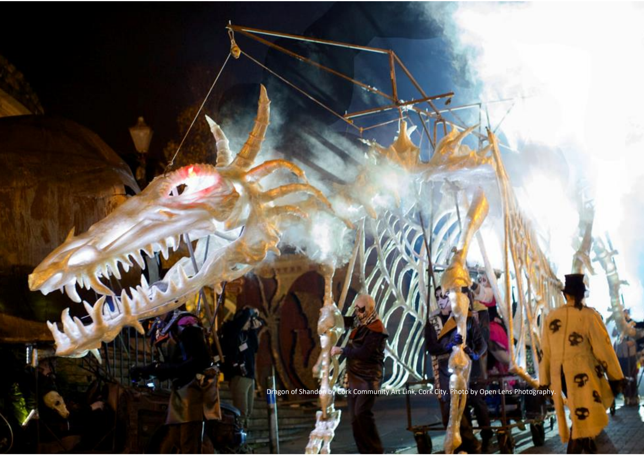
Dragon of Shandon by Cork Community Art Link, Cork City.