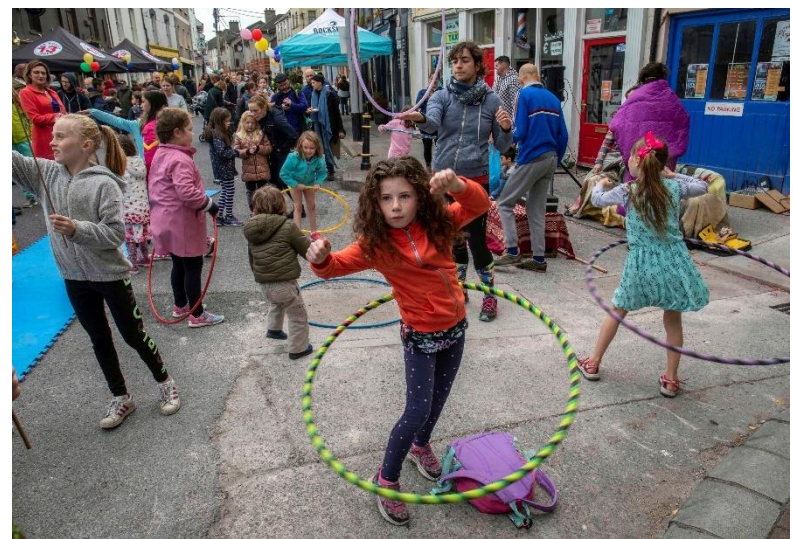
Street Arts Forms clockwise from top left: Paste Ups [5], Asphalt Art [6], Circus [7] and Street Art [8].