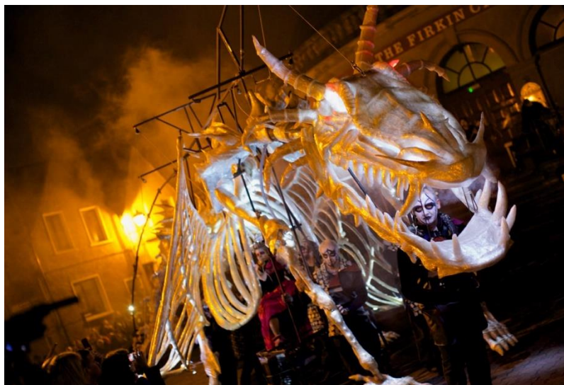
Street Arts Forms clockwise from top left: Music Performance [1], Street Theatre [2], Puppetry and Procession [3] and Installation [4].